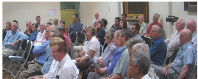
Part of the audience at the forum on the new encyclical at the Centre for Theology and Ministry, Parkville